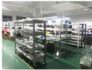
■ Materials Arrangement