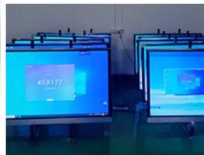
■ Finished Product