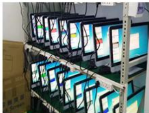
■ Equipment Inspection