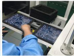
■ Board Testing