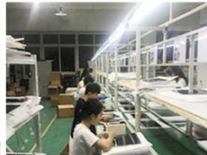
■ External Assembly