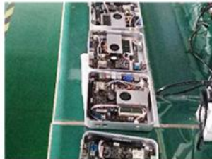
■ Internal Assembly