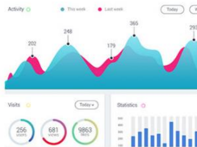
DATA TABLE PRODUCTION