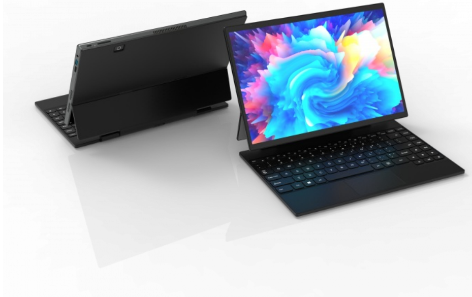
Image processing: independent ISP chip optimizes 30-frame image stability Dynamic scheduling: the processor intelligently adjusts performance to match the usage scenario Product Show