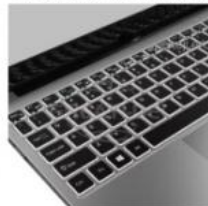
Customize Keyboard Language